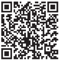
Sealing of Masonry