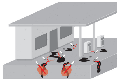
Repair of oil-contaminated cracks