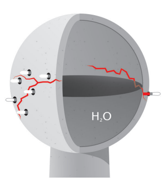
Crack repair in drinking water tanks

*according to test method by Deutsche Bauchemie e.V. (German Industry Association for Manufacturers of Construction Chemicals)